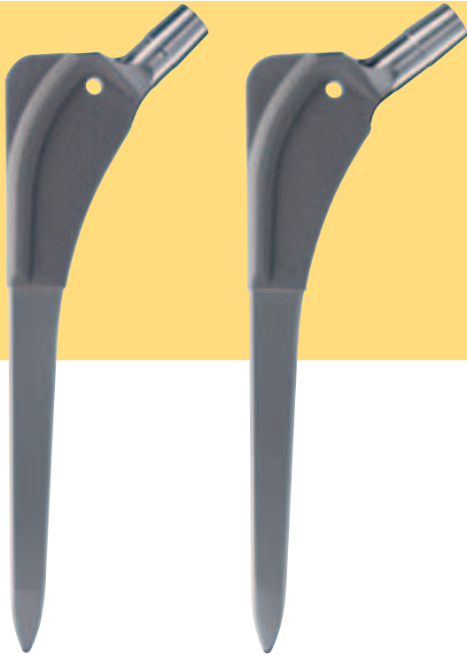
BiCONTACT® S Standard Offset